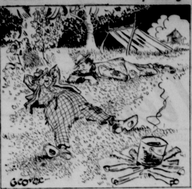
'Of course I get tired of tramping around the country, but a man can't quit just because he's tired!"