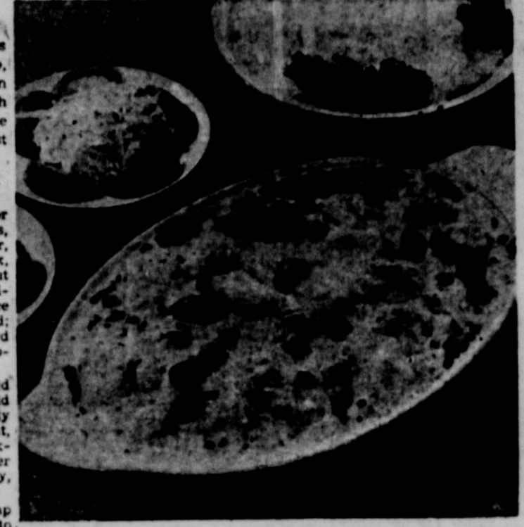
Stuffed olives mixed with cream sauce and served over shrimp and rice guarantee's successful dish.

cup chopped cucumber, 1 table- | half of sour cream mixture. Broil