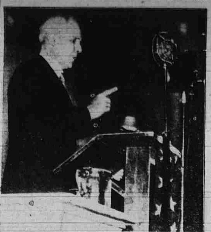
Former United States Senator James A. Reed of Missouri is shown as he spoke in Des Moines in refutation of President Hoover's speech in the same auditorium a few nights before.