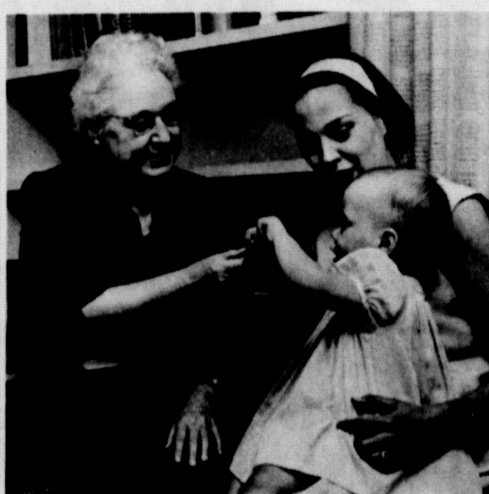
Dr. Virginia Apgar urges vaccination of children against rubella (German measles) to eliminate the disease. When a pregnant woman is infected, her child may be born with severe defects.

Rubella epidemics usually occur in cycles of six to nine years. Many medical authori- ties fear another destructive epidemic next spring. Fortunately, major metropolitan areas, with about 90 per cent of women in childbearing years are im- mune because of early ex- posure to German measles. On the other hand, fewer women in rural areas catch the dis- ease when they are children. To prevent future waves of rubella-damaged babies, the March of Dimes has urged widespread aid in supplying suf- ficient vaccine. A realistic im- munization program to immunize 75 percent of the target group of children will require 42 mil- lion doses. Since only about 10 percent of these children are like- ly to be inoculated by private physicians, government finan- cing of vaccine for the others is vital for effective protection.