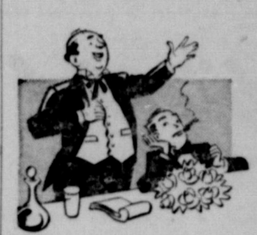
JUST A FEW WORDS

Mr. Repairman—the date for our Doctor of Motors Clinic will be at 7:30 o'clock, the evening of March 10, so make your plans now to be on hand. Remember. the Perfect Circle representatives will be here to give some good pointers. We'll be looking for