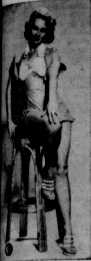
Beautiful, blonde Virginia Mayo, Warner Bros. movie star, relaxes at home in a cool, cotton outfit. Her one-piece cotton suit has a matching bolero and shoes.