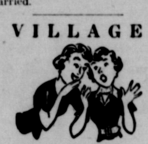
(More or Less)

Teen Town will be held Friday night immediately following the