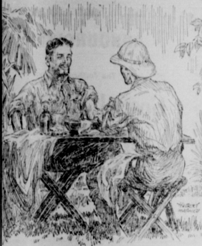
In a way, Jesse Lezear illustrates how a democracy so often calls forth the devotion and even self-sacrifice of its citizens. He is typical of the many Americans, including even a number of prisoners, who have freely offered their own lives in medical experiments for the common good.

WORKING WITH A MEDICAL RESEARCH TEAM TO FIND A CURE FOR YELLOW FEVER, DR. JESSE LEZEAR, IN 1900, VOLUNTARILY SUBMITTED TO INOCULATIONS THAT HE KNEW MIGHT KILL HIM - AND A FEW DAYS LATER, DIED OF THE DISEASE.