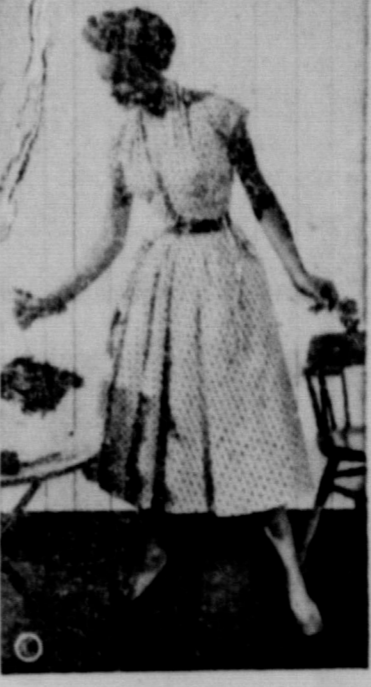
Yep, a hostess who's hep wears voguish black and white cotton for entertaining, the National Cotton Council says. Here is a cool number by Ciro in black and white sequin checked cotton by Hope Skillman. The dress gets air-cooled shoulder slots to give it a halter neck and covered up look, too!