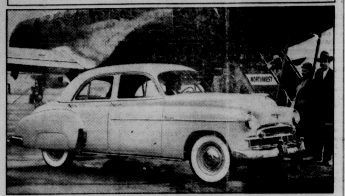
Progressive streamlining of the 1949 Chevrolet is in liner. Notable in the roomier, lower cars is a balance emphasis in this view of the Styleline De Luxe four- in design that adds greater comfort and driving case door sedan against a new Martin 202 passenger air- as well as smart appearance.