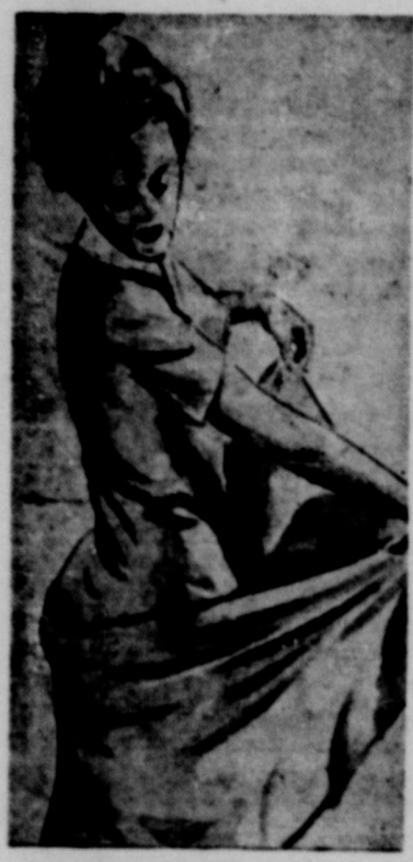
"I'm just a sight and it's your

madder. I'll give you a lift home and then