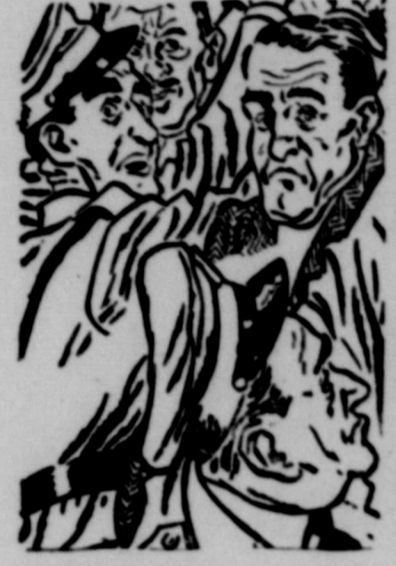
"Young Stark caught 'em. He needed help but he gets the credit."

Steve's retort died on his lips as the commissioner spun on his heel and left. Steve made a mental summary of the case as it stood to date. About a month ago, the two men believed responsible for most, if not all, of the current hold-ups, had