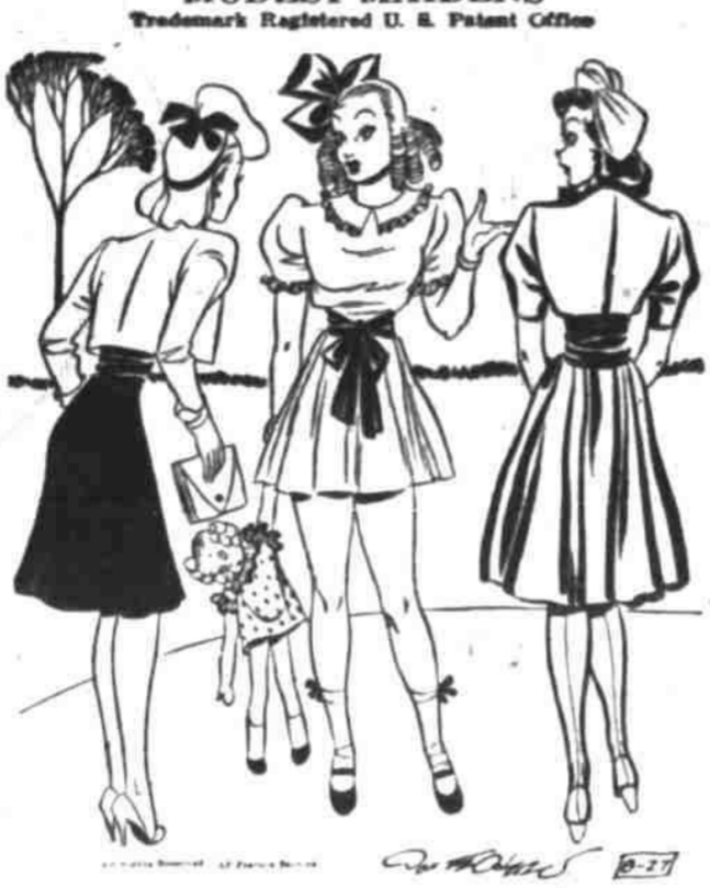
"Mother just couldn't bear to see me grow up."