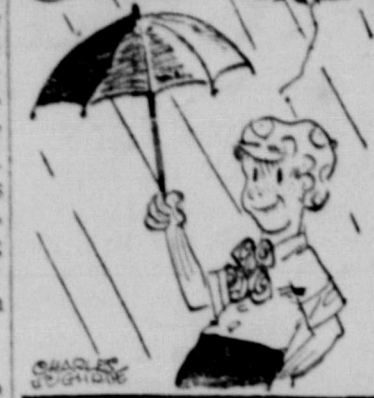
Everybody reads newspapers.

MICKIE SAYS— MOST COPIES OF THIS NEWSPAPER ARE READ BY FROM A COUPLE TO SIX OR EIGHT PERSONS, COUNTIN' TH' NEIGHBORS, WHICH MAKES A GOOD AUDIENCE FOR OUR ADVERTISERS