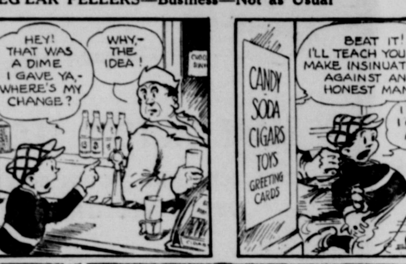
REG'LAR FELLERS-Business-Not as Usual

'LL TEACH YOU TO MAKE INSINUATIONS I GAVE YA A DIME