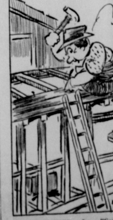
NOVEMBER, 1955. Joe: "Good thing you kept those Victory Bonds." Sam: "Right-O. This den and bathroom are what we've needed since Grace and I set up house-keeping. Lot of other wise bond-holders are modernizing their places, you see."