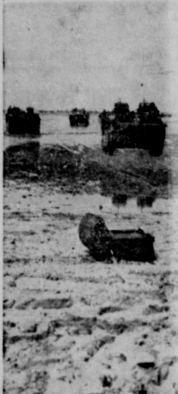
Action at Ryukyu Islands, U. S. Amphibious tanks that War Bonds helped to pay for enabled the Navy and Army action to successfully storm this beach.