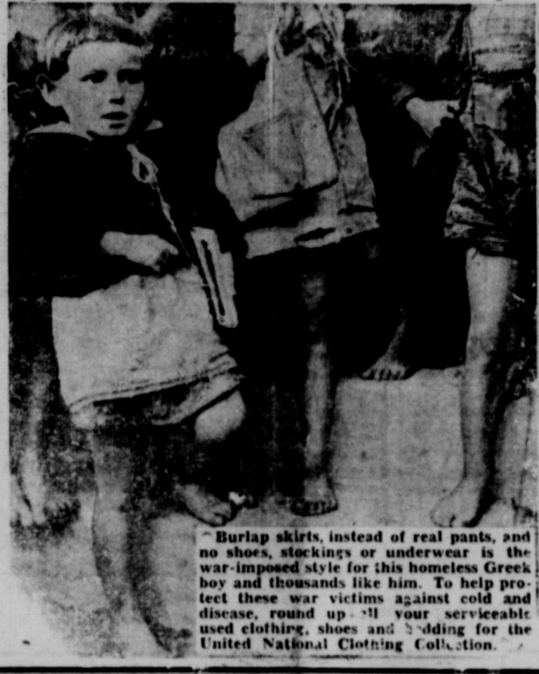
Burlap skirts, instead of real pants, and no shoes, stockings or underwear is the war-imposed style for this homeless Greek boy and thousands like him. To help protect these war victims against cold and disease, round up all your serviceable used clothing, shoes and bedding for the United National Clothing Collection.