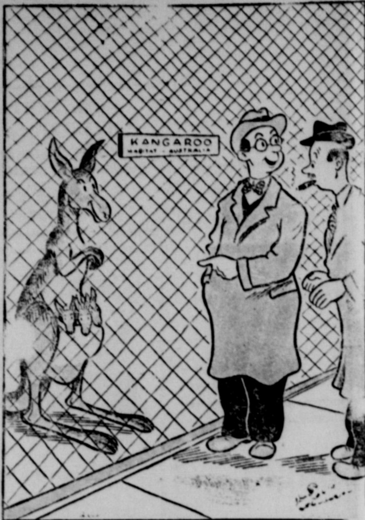
"THAT REMINDS ME - YOU OUGHT TO SHARE YOUR CAR, SMITH!"

Texas is now in its sixth year since 1842.