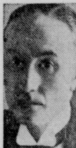
Sir Samuel Hoare

IN THE house of commons representatives of the British government declared that nonintervention in Spain must be preserved to prevent chaos in Europe.