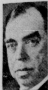
Irvin S. Cobb

There's a lesson here, although, so far as the victim is concerned, it's probably too late to do anything about it.