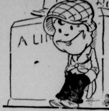
"I have did the same thing Lincoln done - educate myself - says Bill Byers"