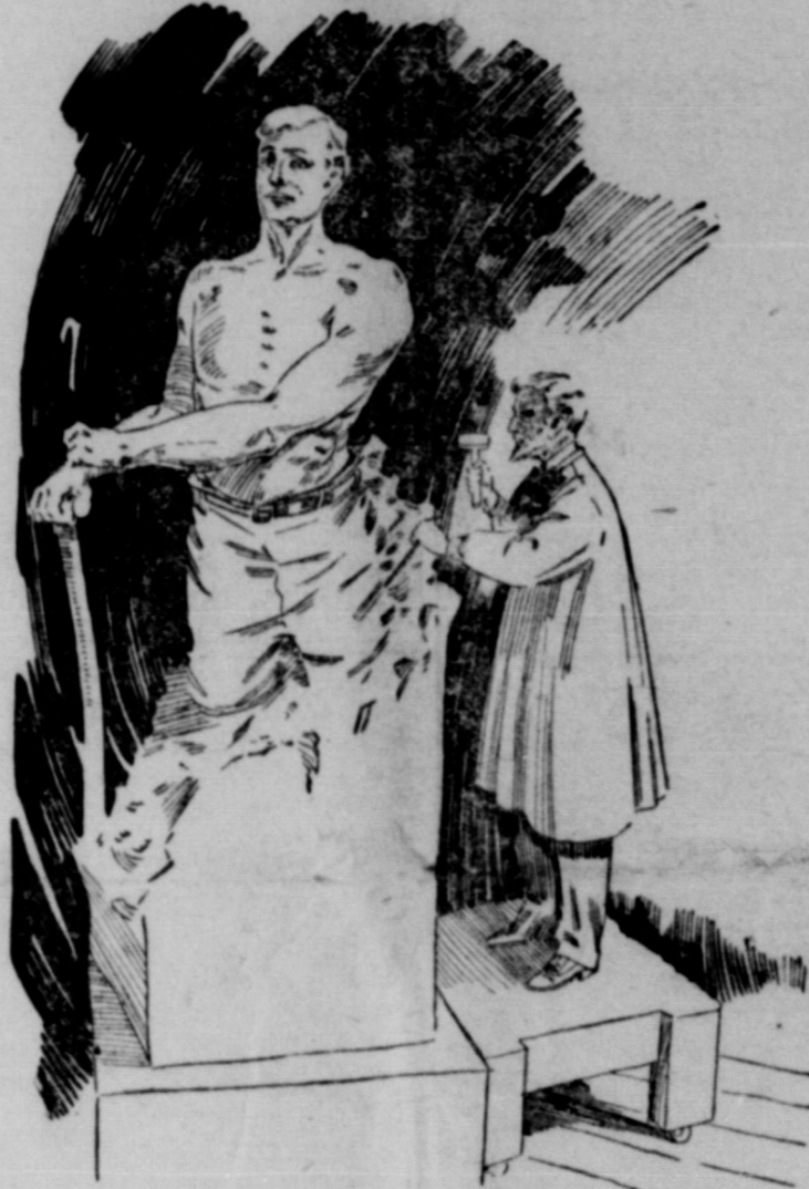
A MASTER HAND.

MICHAEL Angelo made the canvass glow with life and Phidias made marble speak and throughout ages civilization has felt the elevating influence of the painter and the sculptor. Their success was due to the fact that they had the ability to put the stuff in their work and what is true in art, is also true in government. We need in our Legislature men who can put the stuff on our statute books that will make industry glow with life and the soil speak with a glorious harvest.