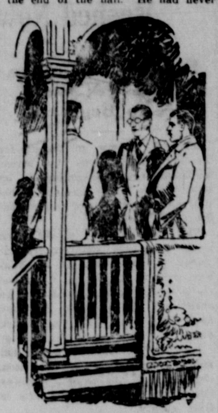
Bassett Showed Them a Staircase the End of the Hall.

Bassett showed them a staircase at the end of the hall. He had never