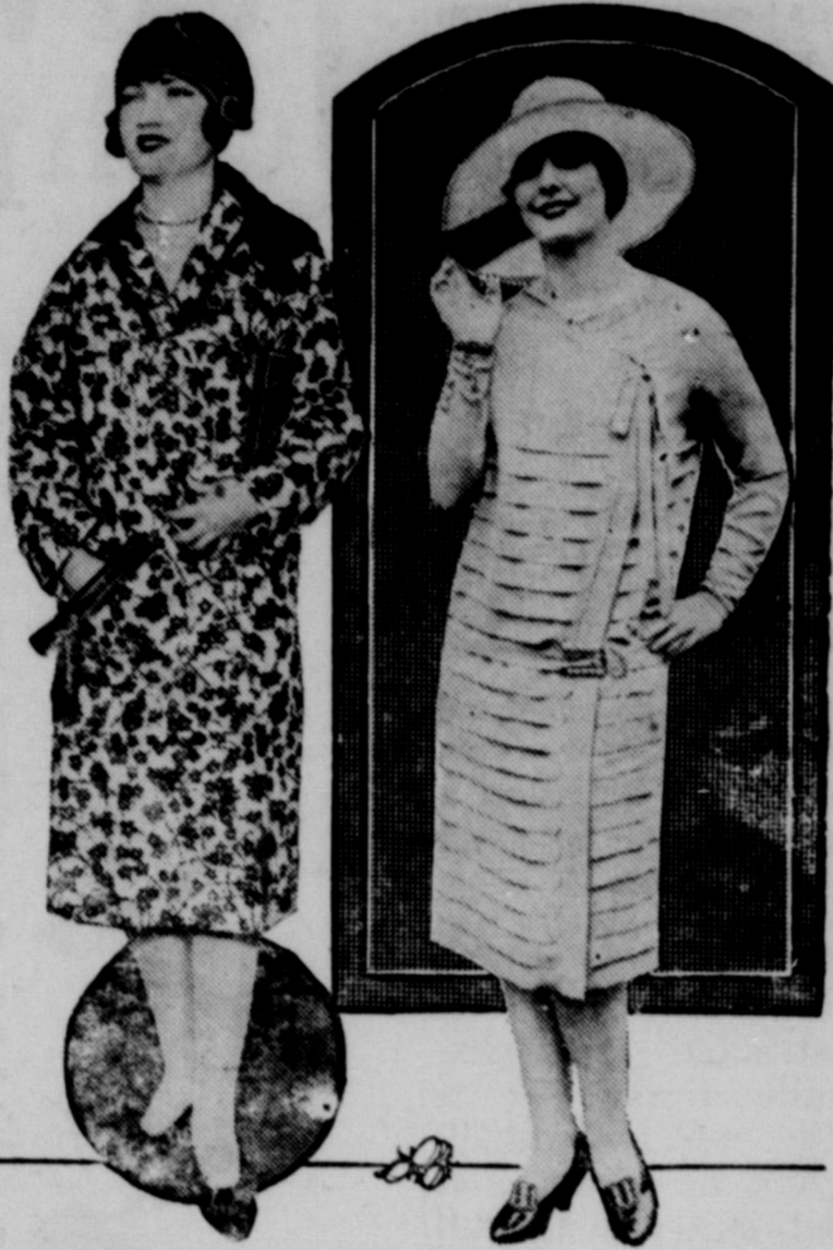
Two smart spring models are shown here. The printed linen chintz coat (left) is red and white, with red bows of grosgrain. A dashing tiered effect is shown to the right, with large hat of horsehair braid.

The horsehair braid hat has a brim slightly wider at the sides and a moderately high crown. The only trimming is a smashing bow of velvet—the very latest trim-