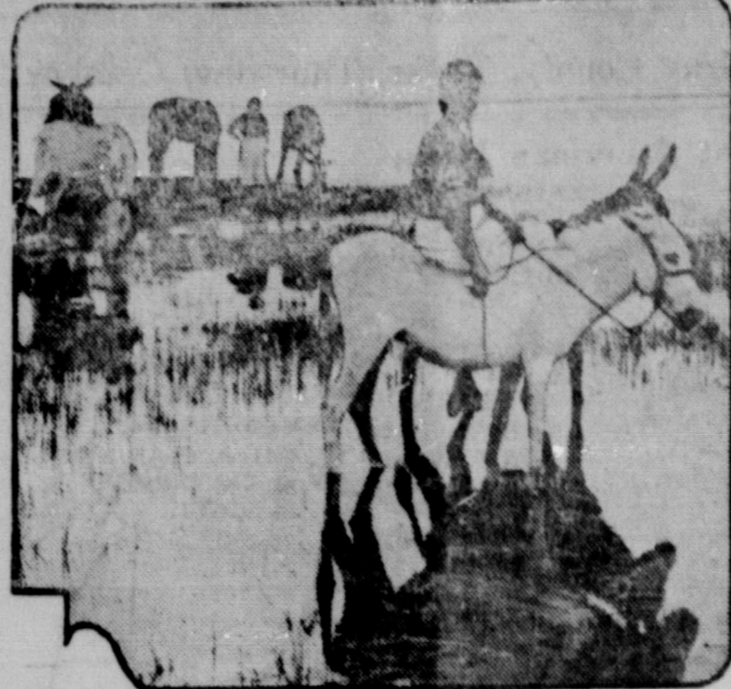
Sturdy Jewish girls are shown watering their burrow in the historic Jordan River in Palestine. Various Zionist agricultural and hydro-electrical development is centering on the river.