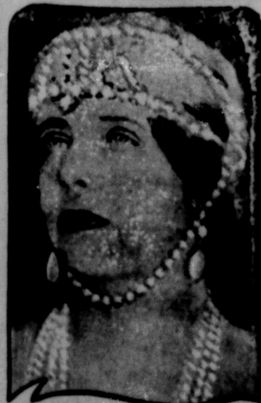
When Queen Marie of Rumania arrived in America she expressed a fondness for pancakes. The reporters asked her how many she ate "one at a time." was her clever answer.