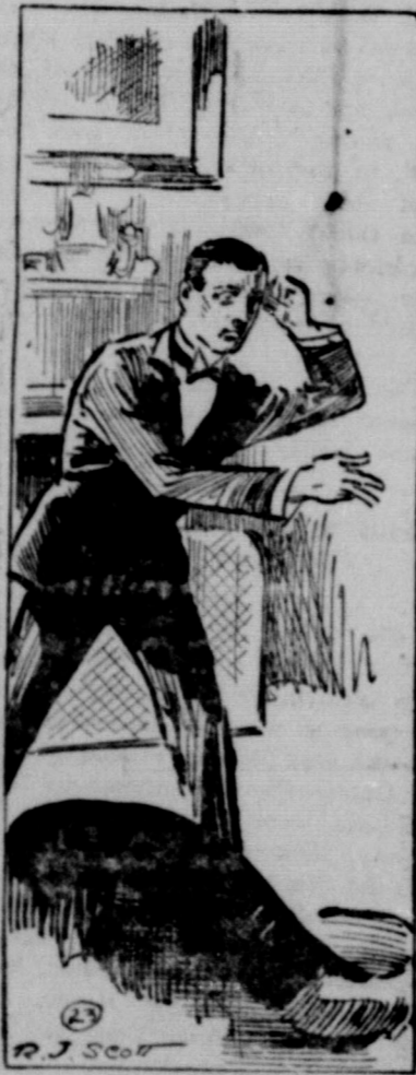
There was a wild expression in his eyes as he turned from the conflagration to glare at Constance

He found more papers lying on the desk and flung them into the mounting flames, whistling merrily. Constance was dumb and inert. She was truly frightened. No efficiency man in his senses could thus behave, she knew; and she could not yet believe that H. Hedge