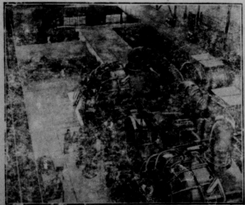
The 100,000 horsepower steam turbo-generator installed at Nitrate Plant No. 2, Muscle Shoals. This is one of the largest and most efficient electric generating units ever built.

—Service With Pep— McLean Phone 153 Texas