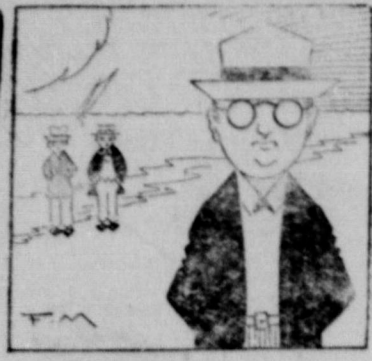
WENT VERY DEEP "That scientist goes very deep into things they say." "Yes; he's studying the bottom of the ocean now."