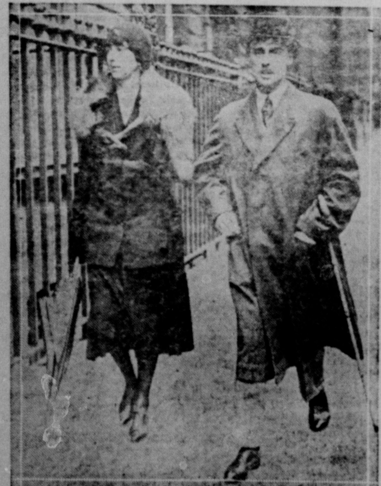
FAMOUS ROYAL LOVE MARRIAGE COUPLE IN LONDON Princess Yolanda of Italy, daughter of the King, and Count Valvi di Bergolo, her husband, the man whom she married after a deal of trouble. Her parents wanted her to marry into some European ruling family, but love finally won out.