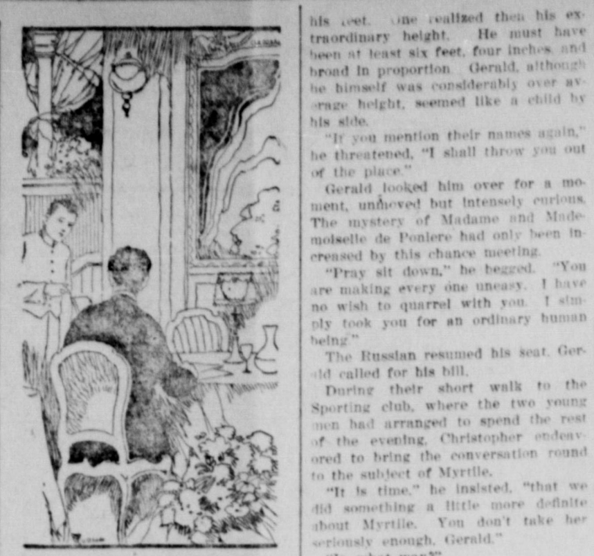
The Boy Made a Prompt Appearance and Stood, Cap in Hand, Waiting for His Order.