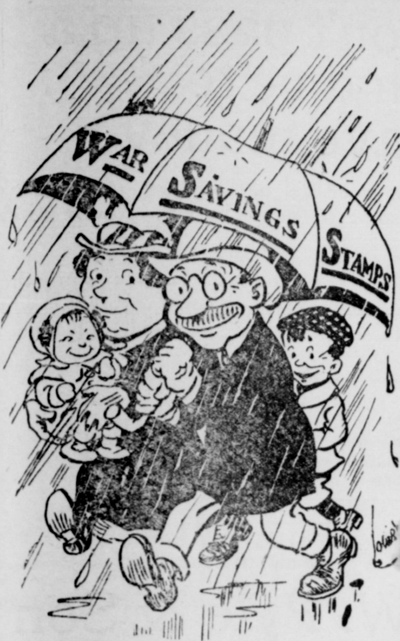
War Savings Stamps are the umbrellas which protect against the driving rain of adversity. Save and buy them regularly and you will have no cause for financial worries.

Have you bought your Thrift Stamp today?