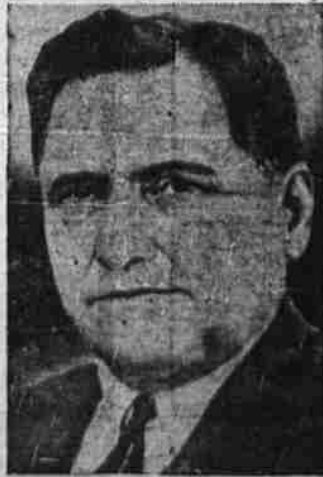
Senator Smith W. Brookhart of Iowa contends blame for present economic conditions should go to the deflation policy started in 1920, which he says "ruined agriculture" and curbed the country's buying power.