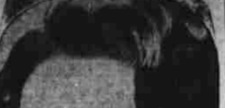
Ethel Merman, who specializes in singing blues, says 'hard-boiled America is growing more sentimental by the hour. Dreary stuff is out, a few blues are all right but sentimental ballads of 30 years ago are in demand, she says.

needs are bath fixtures, a water heater, sewer and gas pipe, installation of fixtures and three single beds with mattresses, pillows, sheets, blankets, etc.