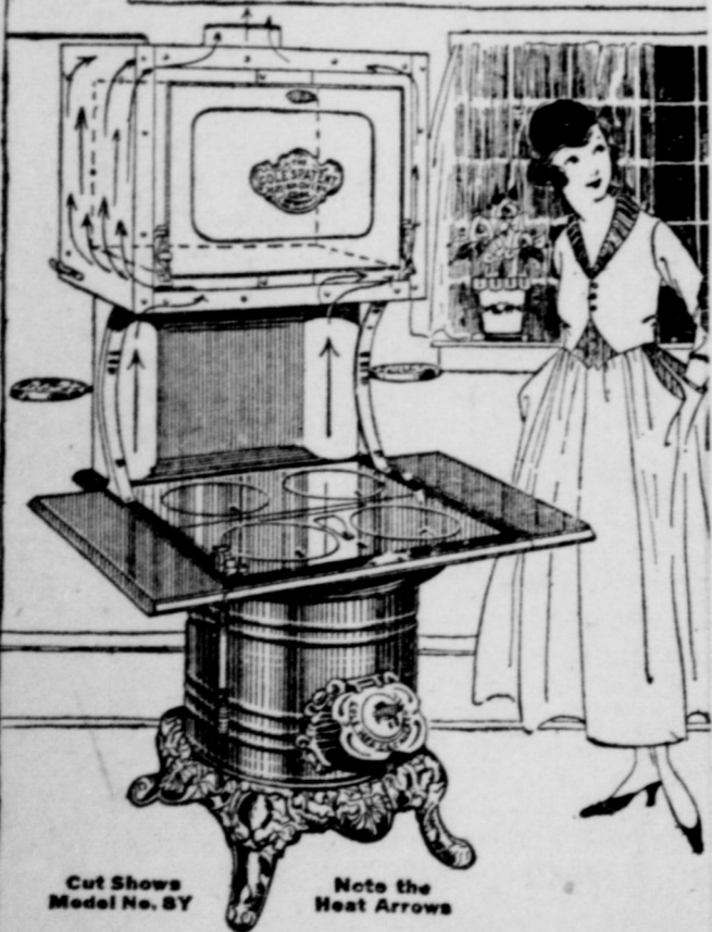
Cut Shows Model No. 87 Note the Heat Arrows