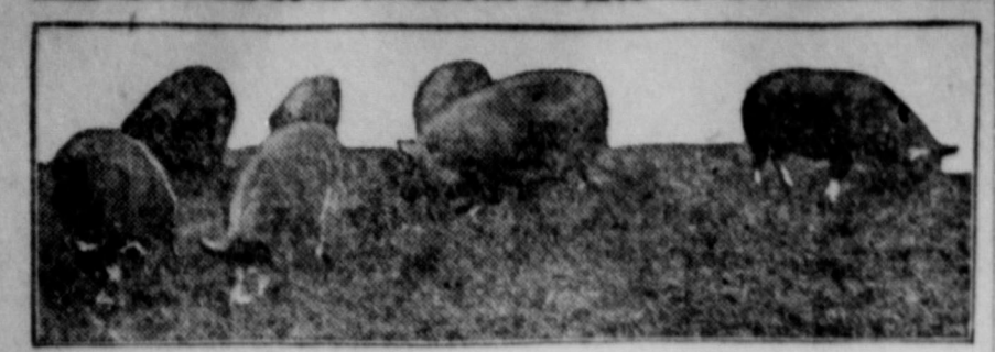
Feeding, But Not Fattening.