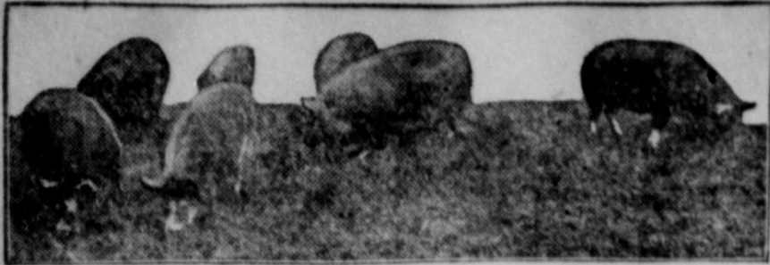
Feeding, But Not Fattening.

(By H. M. COTTELL.) A young sow should be selected whose mother and grandmother have eight or more good pigs at a time, are heavy milkers and quiet, good mothers. The strain should be sufficiently active to thrive on pasture. The young sow should be thick, deep and lengthy and should have not less than ten good teats. The sow pig intended for a breeder should be pushed for the first year and given feeds that will make rapid growth, but that will not fatten. Such feeds as milk, alfalfa or clover pasture, or hay, and moderate quantities of grain, such as wheat, peas, barley, milo maize, and shorts. She should weigh from 300 to 375 pounds at twelve months of age when in thrifty condition, but not fat. Ample exercise every day is necessary for health and to develop muscles and lungs. If the sow has made good growth, she may be bred to drop her first litter when she becomes twelve months old. She should be in perfect health and in good flesh when bred. The gestation period for the sow is about 112 days. As soon as the pigs have been