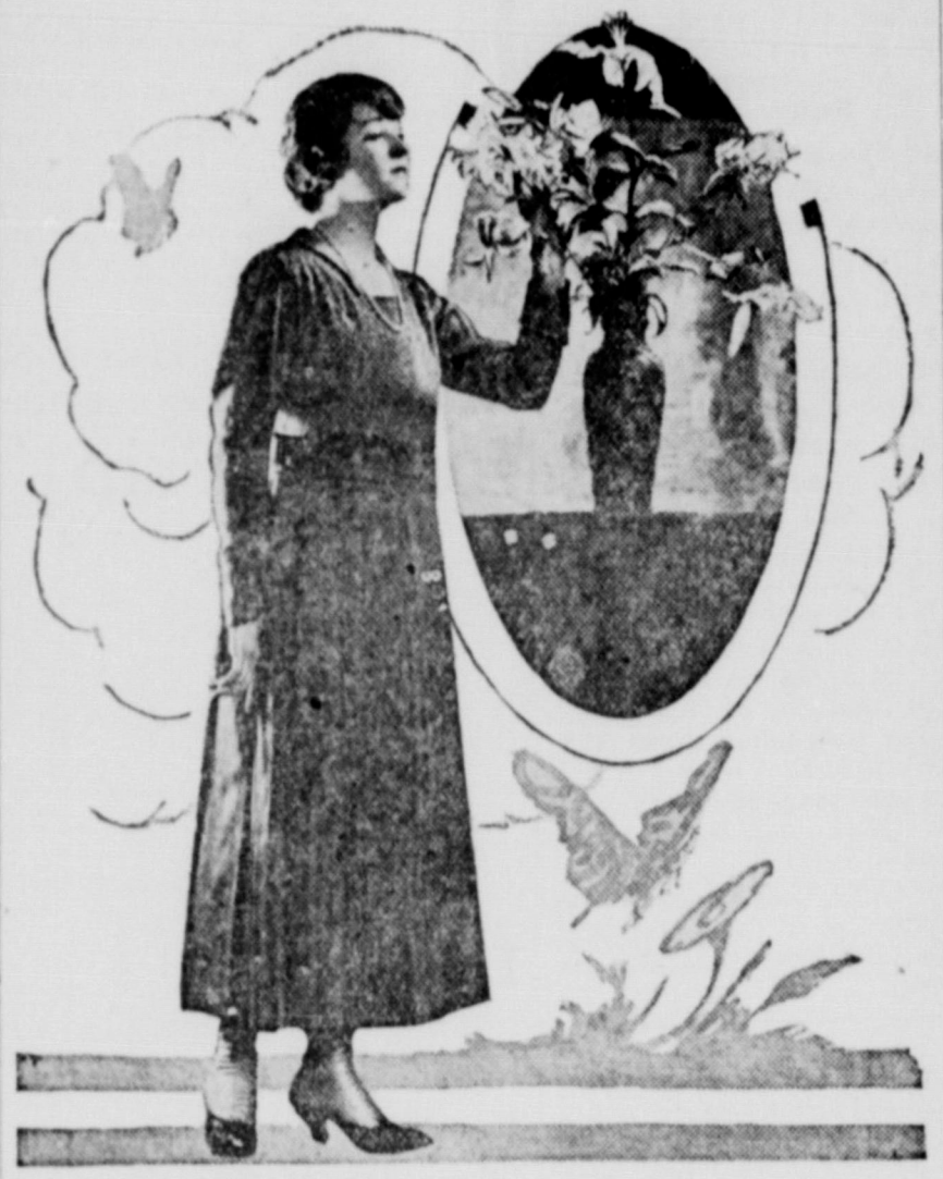
NEW MODELS IN ONE-PIECE FROCK.

rations. Every conceivable method of vestee, collar and narrow turned-back is taken of reproducing it. making in the skirts and bodies has cuffs of satin, in a contrasting color. already been exploited, with plaits and The body of the blouse is rather plain, shirrings utilized where any fuliness with a little fuliness (set in at the is required and the waistline placed shoulder seams) in the front. The anywhere from just below the bust to sleeves are full, gathered into deep cuffs of crepe and these are finished As skirts grow narrower and at the wrist with narrow satin cuffs. my quarter section (160 acres). Most straighter plaits take the lead in pro- All seams are hemstitched. The edges of my stock, harness, implements, etc., viding the fullness necessary, since at of the satin vest are finished with a were bought at sales, all "on time," the same time they insure straight piping of satin, and it fastens with