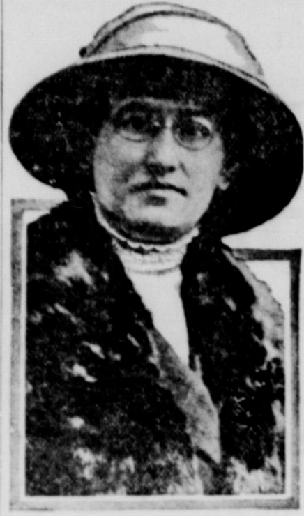
Whose Experience Amazed Friends.