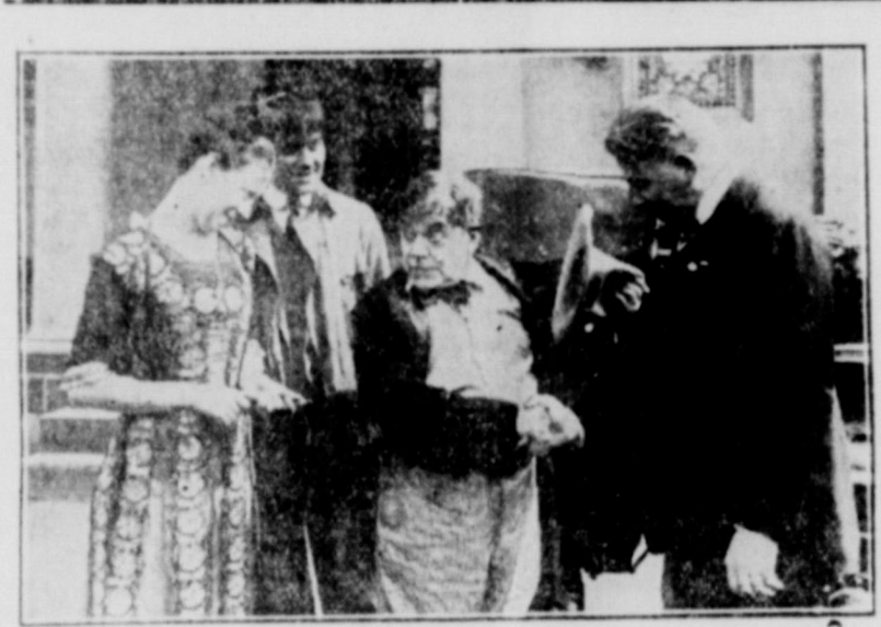
BRINGING UP MOTHER