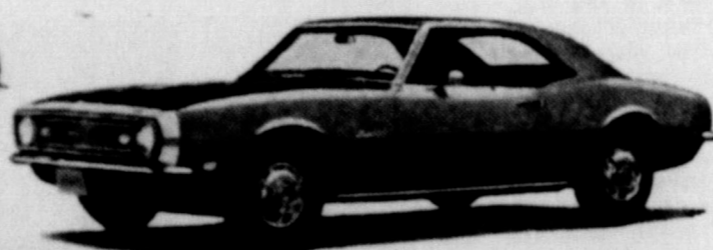
Camaro SS Sport Coupe