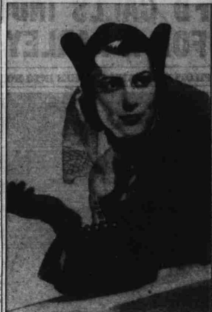
Black felt horns give a novel touch to this French midseason toque which Lewis designs with a black crease veil floating off.