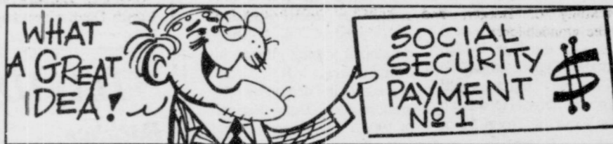
The first Social Security payment was made in 1937.