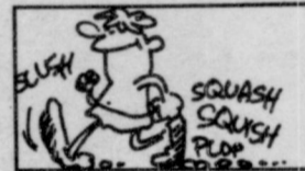
Mayan Indians made rubber shoes by dipping their feet in latex and letting it dry.