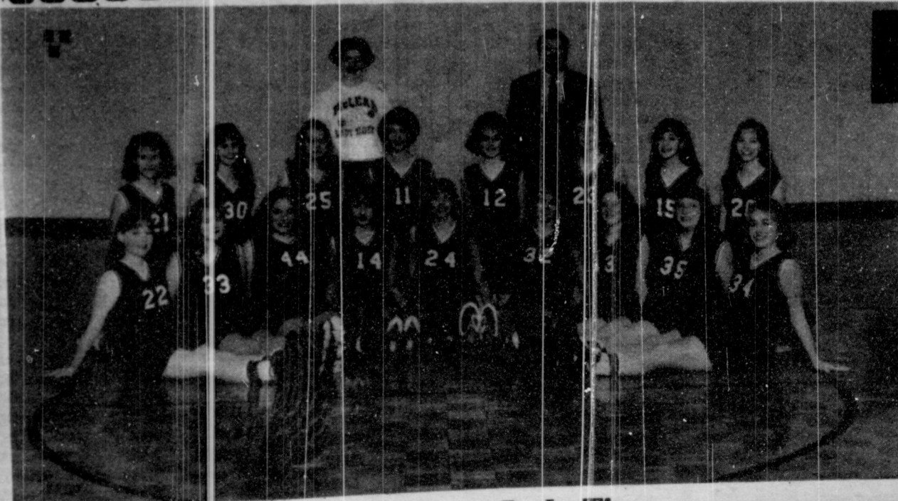
1994-95 McLean Lady Tigers

COMMODITY DAY is Tuesday, Feb. 21st, 9 am to 1 pm at the VFW Building. It is to re-certified. We must know your total monthly income.