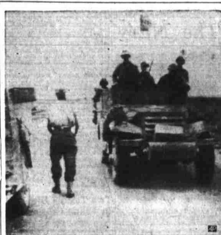
Join Forces—Armored car patrols of British (left foreground) and American soldiers pause to exchange greetings at the Gabes-Gafsa road where units of Lt. Gen. George S. Patton's U.S. Army Second Corps were joined by a column from Gen. Sir Bernard S. Montgomery's British Eighth Army April 7 after Gen. Rommel's Mareth line defenses were broken.

WASHINGTON, April 13 (AP)—President Roosevelt, dedicating a marble temple to Thomas Jefferson, declared today that those fighting today's war would learn what Jefferson knew—that the "dawning of liberty can well be seen in the dawn of more liberty."