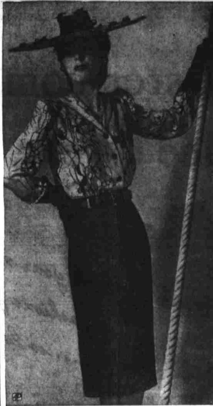
The Shirtwaist Returns in a right-for-the-times skirt and marble print shirtwaist top, designed for war duty by Norman Norell.