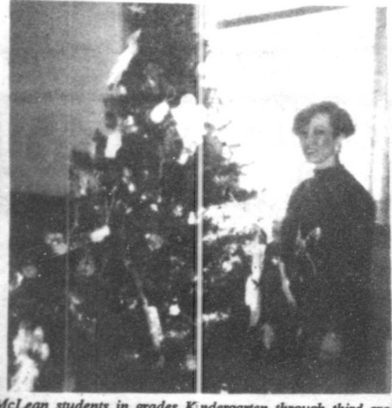
McLean students in grades Kindergarten through third grade decorated the tree at the Bank of Commerce. Stop by to see it and Santa on December 14th at 9:00 a.m. till 4:00 p.m.

Commerce Bank Building No. 5 Thursday, December 10, 1992 779-2141