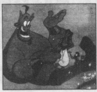
The Making of Aladdin Watch this exciting behind-the-scenes special about Walt Disney Pictures' newest animated feature.