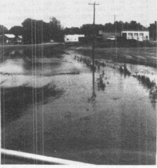
Usually just a trickle, this drainage ditch is overflowing near the City Barn after the recent rains.