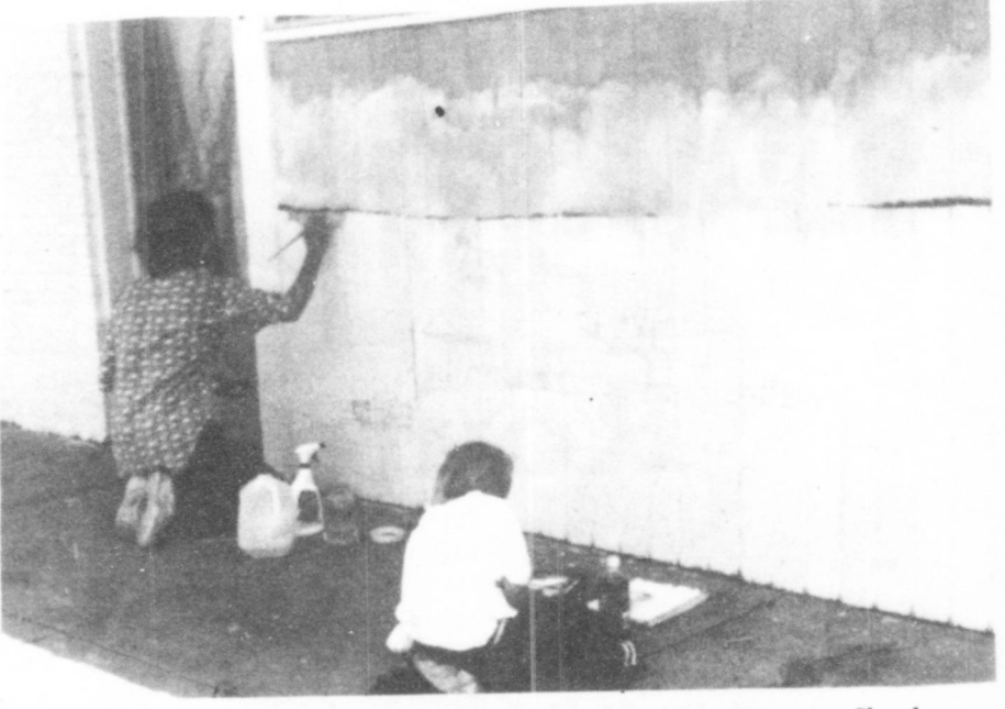
Danelle Comer paints the front of Jasper Roofing with a Route 66 scene. She plans to have the picture done by this weekend. The picture includes Route 66, cattle, an old '57 Chevy Convertible, a '57 Chevy hardtop, and a large drawing of a Victorian House. Ashley Comer, 7 years old keeps a close eye on the painting.