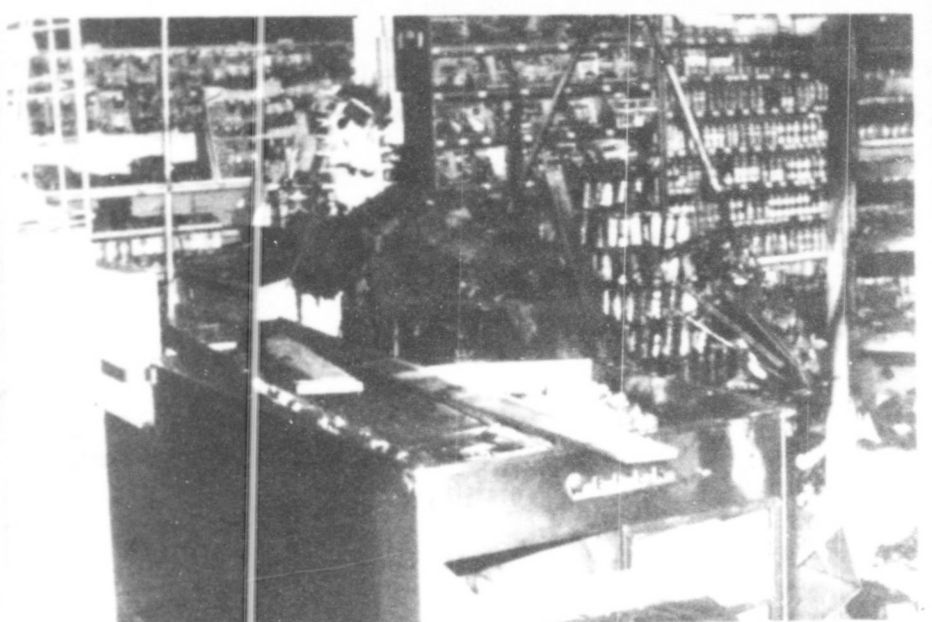
Pictured above is all that is left of the cash register after it was hit by lightning, causing a fire and burning the cash register and area around it.