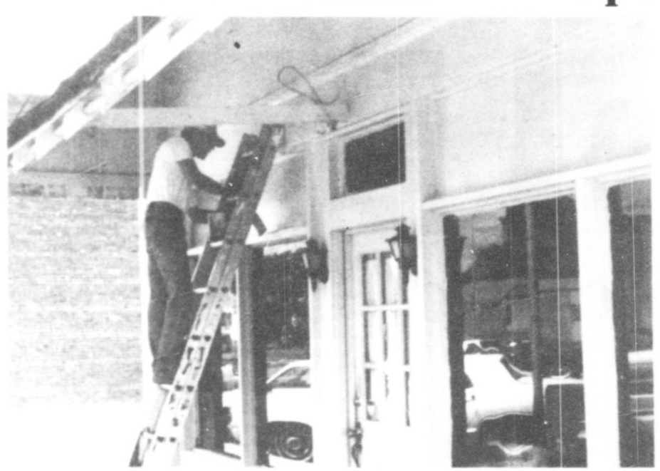
Jim Ridgeway paints the McAnear Insurance building in preparation of the Rodeo coming up this weekend. The Route 66 Mural will be hung on the south side of the building.