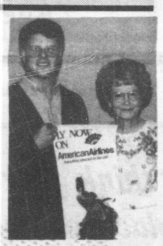
Square House Museum Auction

Amarillo news media continuing to find it hard to mention Groom when they speak of making the movie "Leap of Faith."