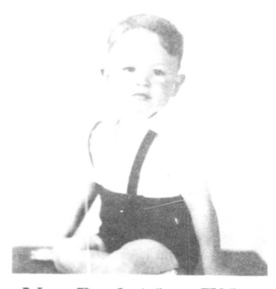
Not Bad After Fifty Ilove you, PaPa