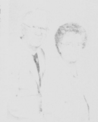
The couple has seven grandchildren and three great-grandchildren.

THE GROOM NEWS—Page 3 Thursday, May 14, 1987