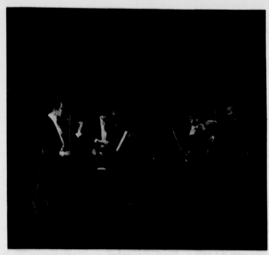
HARRINGTON STRING QUARTET