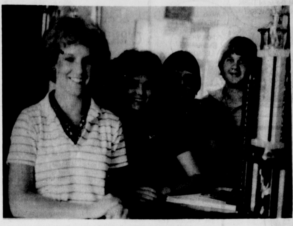
TENNIS REGIONAL QUALIFIERS