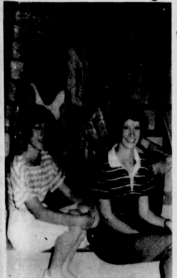
REGIONAL TRACK OUALIFIERS