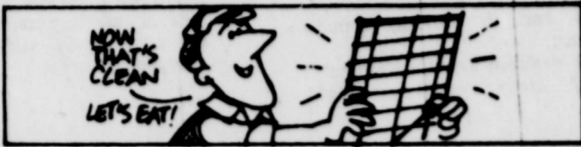
NOW THAT'S CLEAN LET'S EAT! Stove grills can be cleaned by soaking them overnight in hot water and two cups of detergent.