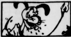
A dog does not perspire by panting. It pants in order to cool itself. Actually, a healthy dog rarely perspires at all.