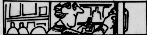
Wiping your refrigerator gaskets with vinegar can help eliminate mildew and odor.