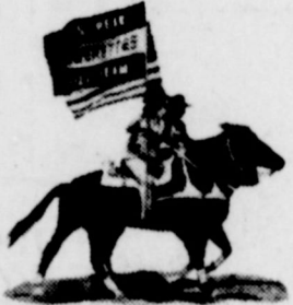
Pikes Peak Rangereettes

FOR RESERVED SEATS Call 669-3241 or Write Box 1942, Pampa, Texas 79065