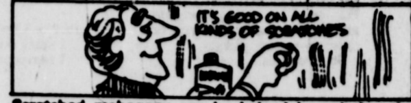
IT'S GOOD ON ALL KINDS OF SCRATCHES Scratched mahogany can be helped by polishing the scratches with iodine, then polishing.