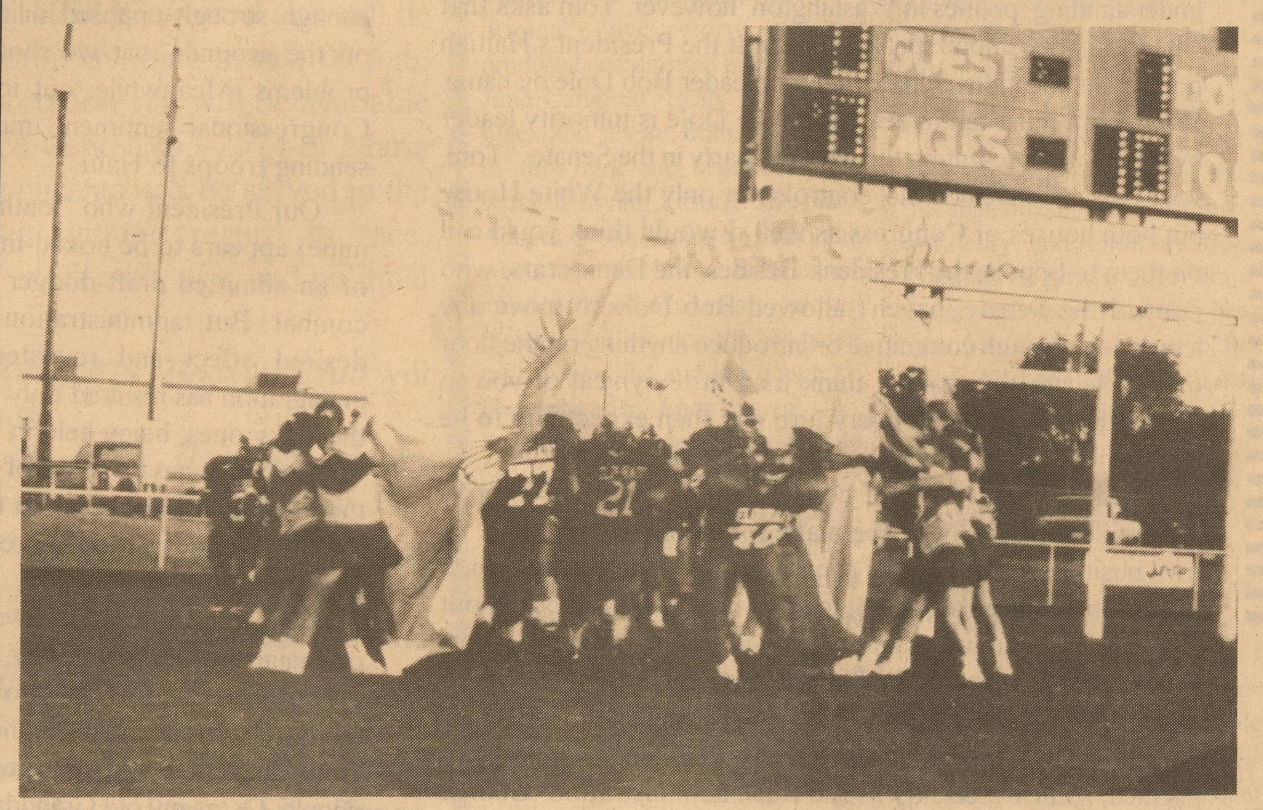
Shown above the Eldorado Eagles Varsity roars into Eagle stadium to kick-off the season against Junction. The Eagles dominated the game and notched up a 35-0 win.