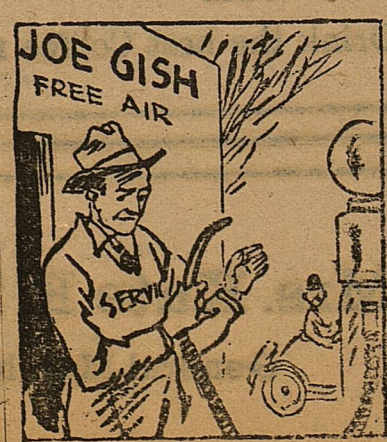
MORE THAN ONE MAN THIS TOWN KEEPS HIS RE-LIGION IN HIS WIFE'S NAME