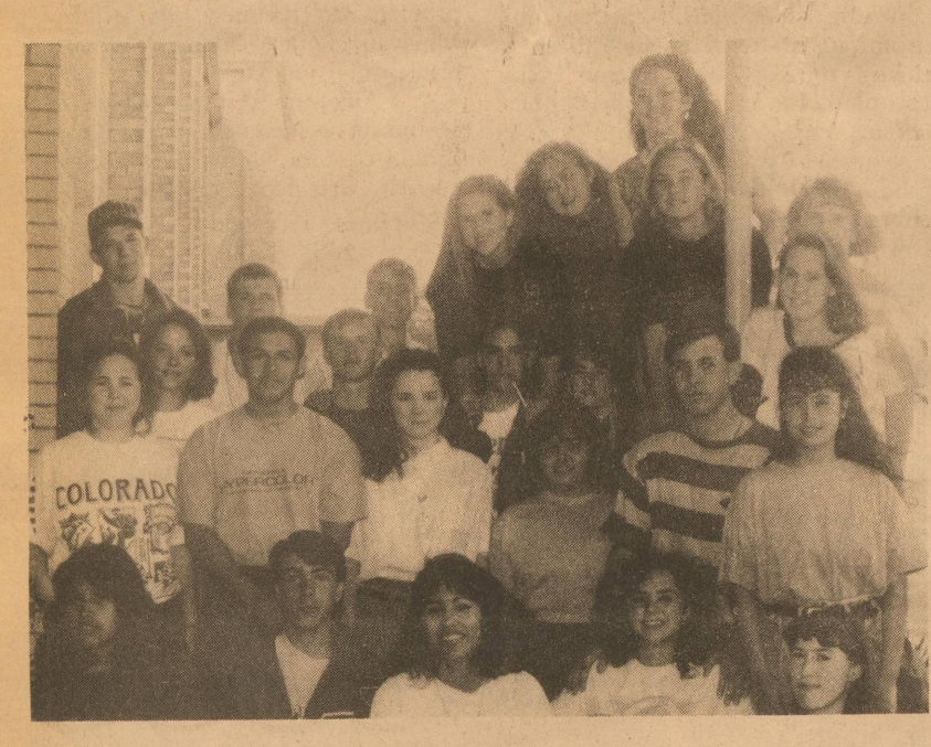
High School Academic U.I.L Entrants