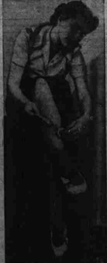
NAZI STOCKINGS favored by Berlin girls for summer wear, are "patented" on the bare legs, giving the appearance of a silk surface. The substance comes in various shades, is spun from a tube like tooth paste, and is brushed on.