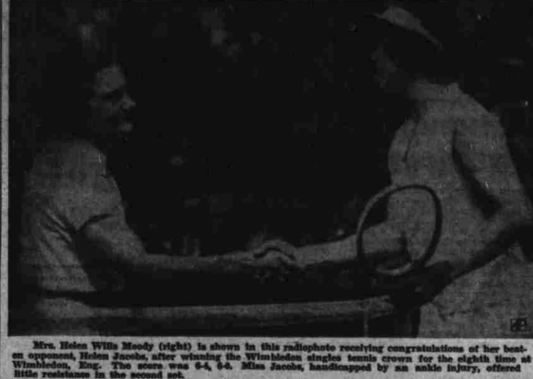
Mrs. Helen Wills Moody (right) is shown in this radiophone receiving congratulations of her best opponent, Helen Jacobs, after winning the Wimbledon singles tennis crown for the eighth time at Wimbledon, Eng. The score was 6-4, 6-4. Miss Jacobs, handicapped by an ankle injury, offered little resistance in the second set.