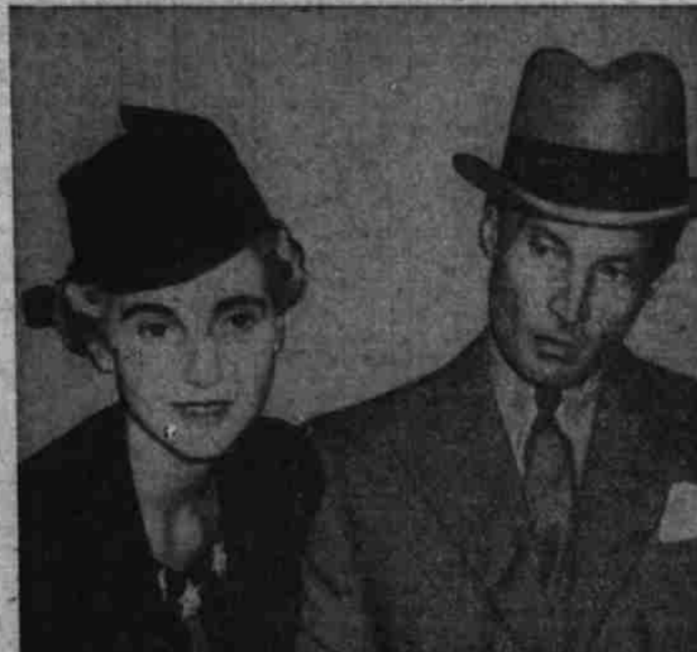
HAPPY DAYS—The above picture of Countess Barbara and her Danish nobleman husband was made in days that were happier than now, while the two are arguing of divorce and payment of huge sums in a London court.