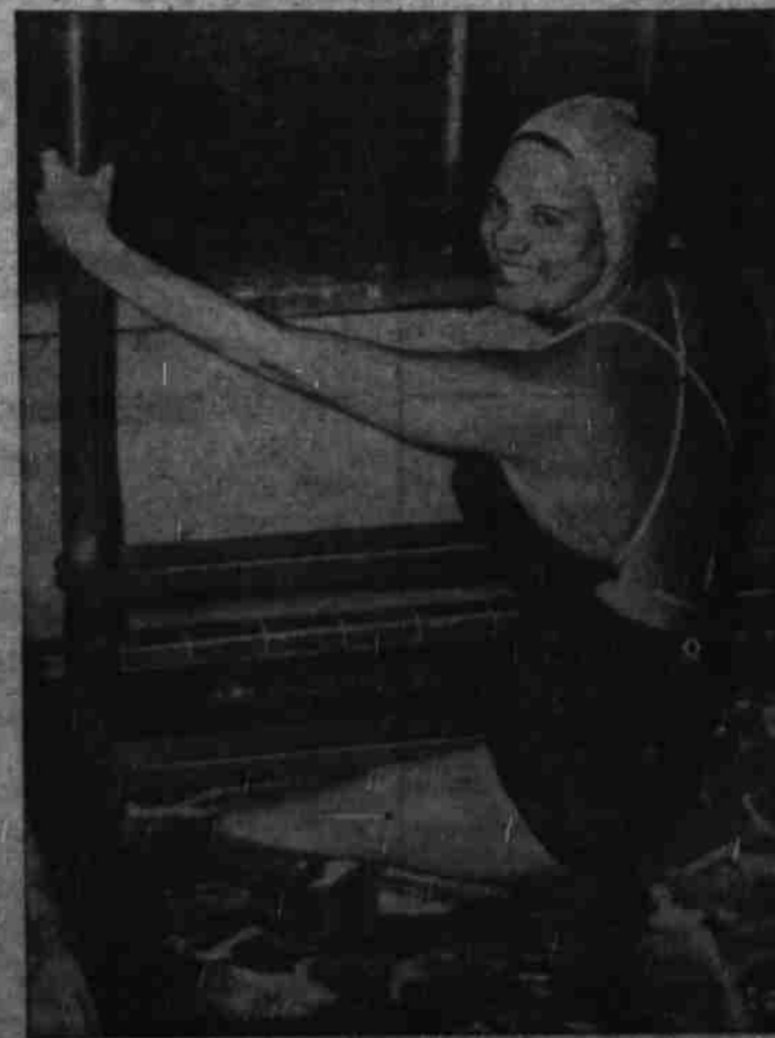
THE WATER'S FINE for Georgia Coleman, Olympic diving champion whose grave illness last year temporarily prevented use of her legs. Now regaining health, she dived into San Francisco pool, capable to use a 16-foot board in a year.