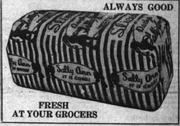
ALWAYS GOOD FRESH AT YOUR GROCERS

666 in 7 days and relieves COLDS first day. Liquid - Tablets Headache, 30 Salve, Nose Drops minutes. Try "Rub-My-Tam" - World's Best Liniment.