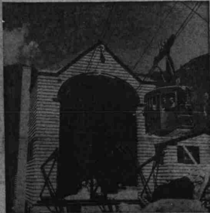
A MILE UP this car must travel, on Cannon mountain's new aerial tramway near Franconia, N. H. Two cars on newly finished sky-ride are to be named Lincoln, Lafayette.