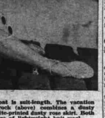
and white. The coat is suit-length. The vacation spectator sports frock (above) combines a dusty rose jacket and white-printed dusty rose skirt. Both jacket and skirt are of lightweight knit wool.