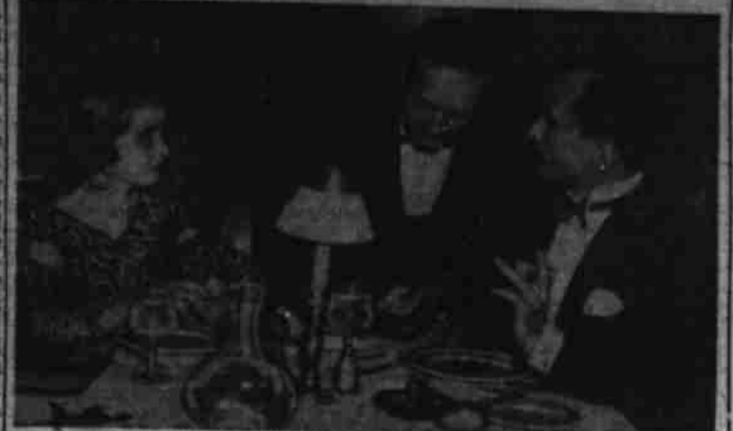
YOU'D EAT HIGH PRICED FOOD in ritzy surroundings and with plenty of attention from waiters if you lived the life of Barbara. Here she and Count Court von Haugwitz-Reventlow dine in San Francisco in May, 1935, shortly after their marriage.

By The AP Feature Service Could you stand the life Barbara Hutton has been living as Countess Haugwitz-Reventlow? So much of the life of the very rich is lived these days before cameras that news pictures give you a pretty good idea of what it is like.