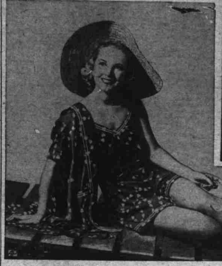
HOLIDAY HABITMENTS Here is a heart-plashed swim suit that hints at romance on the beach. It is made of one of the season's new cottons and its color scheme is blue and white.

of white for both clothes and lingerie. 6-Do not forget that sports girdles are as necessary as evening girdles. 7-Consider the comfort of washable clothes for both day and evening wear.