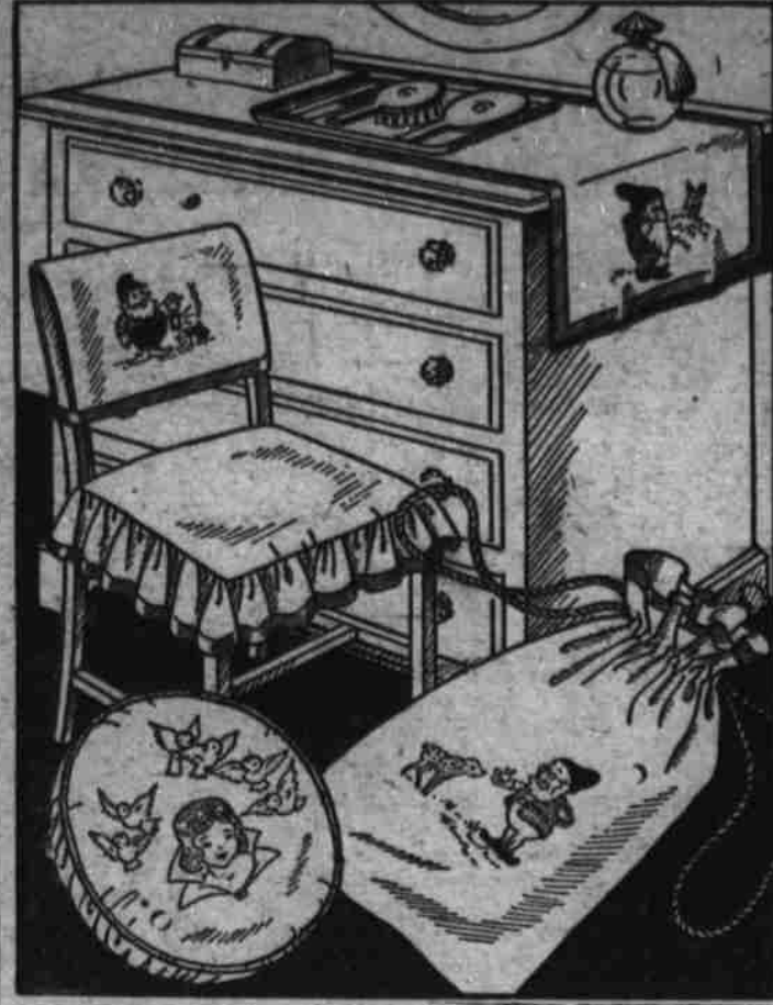
DWARFS AT HOME Here's a transfer pattern design that will brighten some room in your house—most likely a child's.