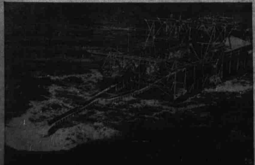
THAT'S GOLD IN THEM THAR WATERS' skilled operators of the Markonko, said to be the world's largest dredger, as they began dredging in Holland's Bolder Zee. The men seek to sink the huge millions in gold—on the British frigate Lolima which sank in a gale about 1700. This is an air view of the dredging operations, and shows also of the huge Markonko.