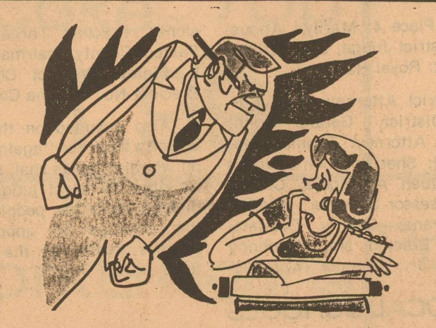
Being Boss & being Bossy are not the same thing.

Total Hair Care Service Offering Spiral & Stack Perms Men's & Women's Cut & Style Tooter's Beauty Shop For appointments after 5:00 Call for Toya 853-2798