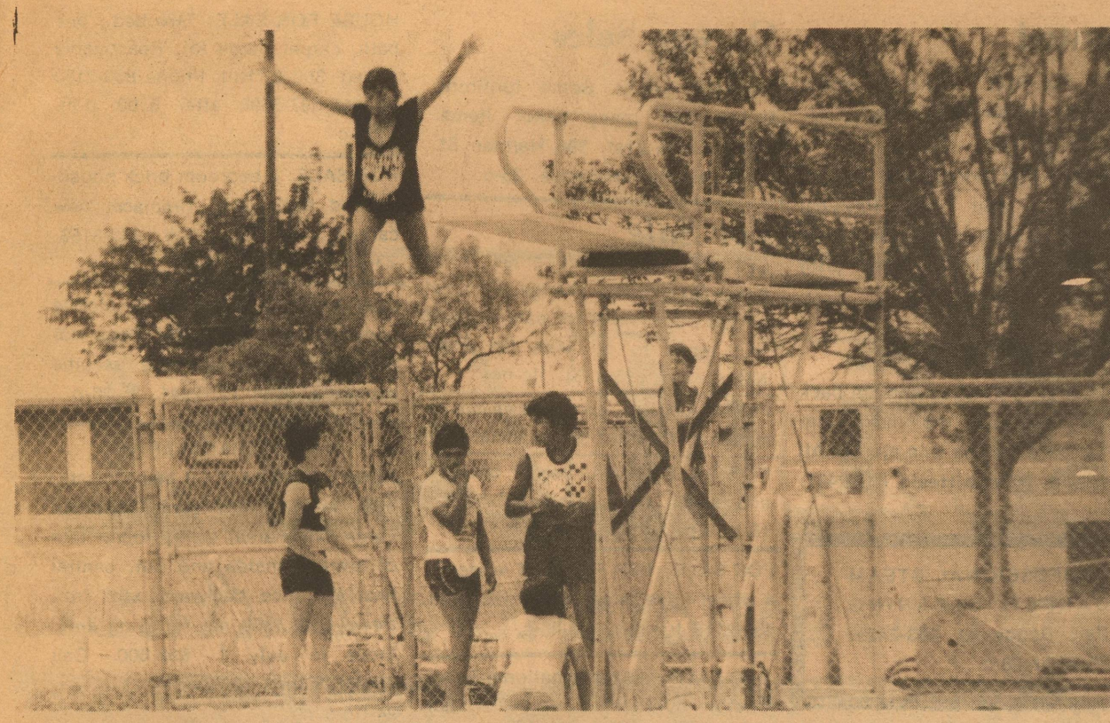
The most popular spot in Eldorado can be found at the municipal pool