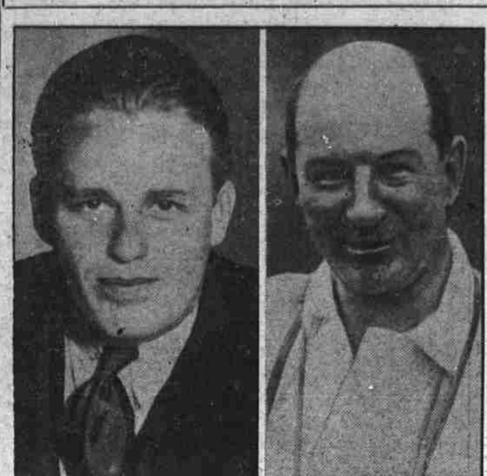
The name of Elliott Roosevelt (left) son of the president, was mentioned as the recipient of $3,000 cash under an unfulfilled contract for a $500,000 commission for sale of military airplanes to Russia in a deposition by Anthony Fokker, airplane manufacturer (right), made public by the senate committee.