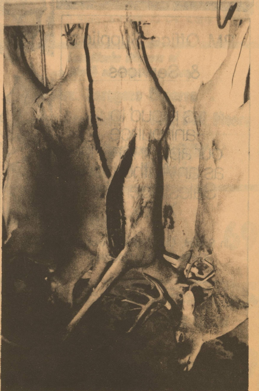
Sofge's deer storage reached near capacity last week-end as hunters converged on Schleicher County.