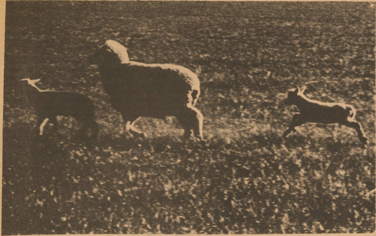
This ewe and her babies are a common sight this time of the year here in Eldorado. New lambs are always a sign of spring.